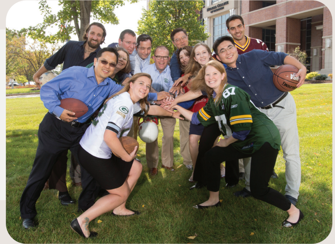
MCW neuropsychologists, sports medicine experts, and imaging specialists team up for concussion research.

When President Barack Obama addressed the nation about the problem of concussion — from kids’ sports, to our nation’s warfighters — he called upon the Medical College of Wisconsin to help. Because of its international reputation in concussion research, MCW was named to lead the advanced research core for the NCAA-Department of Defense Grand Alliance, a program created by the White House to generate a comprehensive picture of concussion.