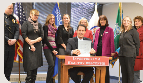
Governor Scott Walker signed a bill into law that expanded child psychiatry access statewide.