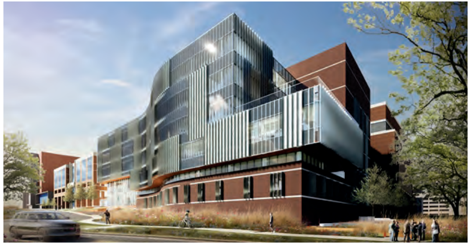
An architectural rendering of MCW's new Cancer Center Research Building.

In 2019, MCW received a $10 million Wisconsin State Building Commission grant for a new Cancer Center Research Building. Construction on the 150,000-square-foot facility broke ground in September 2022; when completed in late 2024, it will be the only cancer-dedicated research facility in Milwaukee and eastern Wisconsin.