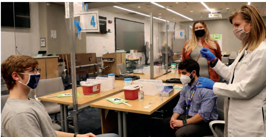
MCW School of Pharmacy faculty and students assist in providing more than 19,000 COVID-19 vaccines to healthcare personnel and other eligible populations in 2020-2021.

Members of the pharmacy school faculty testified to the Wisconsin Legislature in support of the expansion to back vaccination efforts. In February 2021, Wisconsin Act 3 was signed into law. The legislation allows first- and second-year student pharmacists to administer vaccinations recommended by the Advisory Committee on Immunization Practices and allows other healthcare providers the ability to supervise student pharmacists during vaccinations. In response to the passage of this legislation, MCW's School of Pharmacy now is able to provide immunization training earlier in the Doctor of Pharmacy (PharmD) program. ■