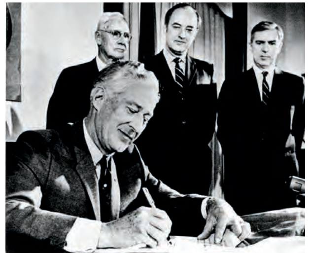
In 1969, Wisconsin Governor Warren J. Knowles signs legislation authorizing a $3.2 million appropriation to aid the financially troubled Marquette School of Medicine.

In the late 1960s, local business and community leaders realized that the area was in danger of losing its only medical school. Recognizing this threat, Milwaukee County and the Greater Milwaukee Committee formed the Heil Commission to explore the community's options. In January 1967, the Heil Report determined that it was vital for Milwaukee's future growth and for the health of its citizenry to develop an academic medical center –