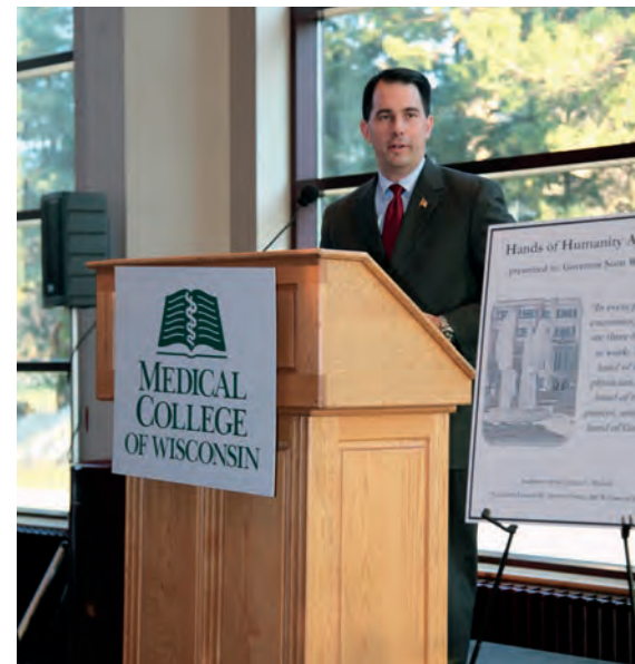
Wisconsin Governor Scott Walker receives MCW's Hands of Humanity award on April 9, 2014, recognizing his transformative vision and leadership for healthcare.

develop community-based medical education programs (as they were first called) in both the Green Bay and central Wisconsin areas based on a comprehensive, monthslong evaluation. The timeline for development called for matriculating the first class at the initial site in July 2015 and at the second site in July 2016.