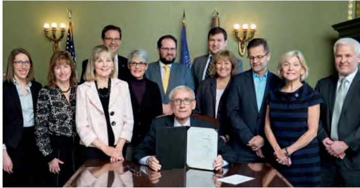
MCW faculty and staff join Governor Evers and others for the signing of 2019 Wisconsin Act 150, which allows for the reimbursement of travel and other costs related to participating in cancer clinical trials.