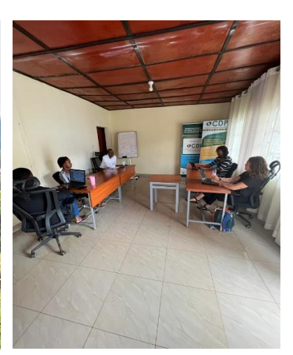
Mpazi Informal Settlement