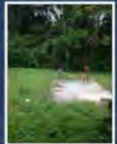
"Exam Room on a mobile clinic in Otaxa, Belize" Heather Koch, M4