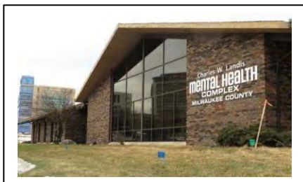
Milwaukee County Mental Health Complex