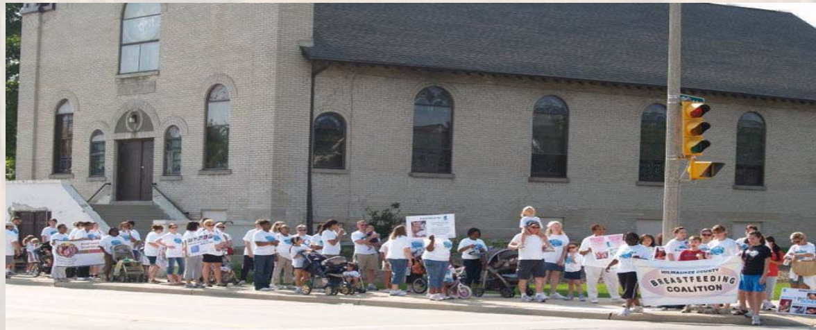
Milwaukee County Breastfeeding Coalition Annual Walk