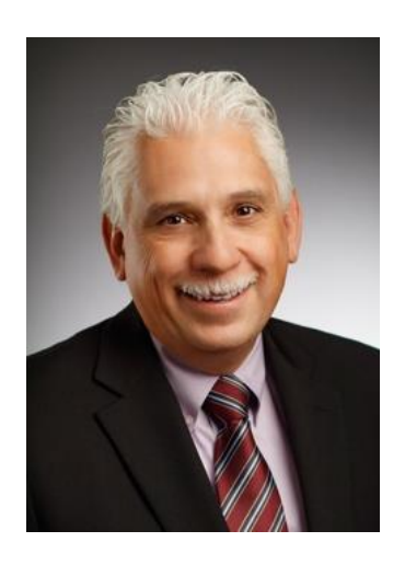
Welcome to the Medical College of Wisconsin School of Pharmacy!

I am delighted to welcome you to the MCW family and the profession of pharmacy. Our goal is to produce highly qualified pharmacists, ready to engage in patient-centered care in a variety of settings, including primary care. With advanced practices skills such as physical assessment, point of care testing, comprehensive medication management, and chronic disease management, we believe our graduates will be well positioned to be comprehensive care providers throughout their careers.