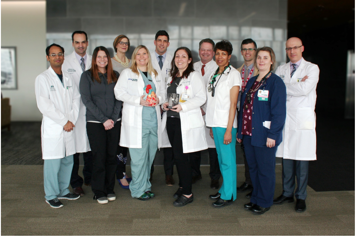
Structural Heart Disease Team

The interventional fellow is responsible for pre-procedural patient assessment, determination of the indications, risks and benefits of the scheduled procedure, and helping to develop an appropriate procedural plan. The fellow is an integral part of the interventional team responsible for the daily care of interventional cardiology and structural heart disease patients, and providing hospital based clinical consultation. In addition to hospital and cath lab duties, the fellow will participate in a weekly longitudinal cardiology clinic and have the equivalent of ½ day per week protected for research.