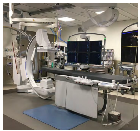
Froedtert Hospital Hybrid OR

The Froedtert Hospital Cardiac Catheterization Laboratory is comprised of 4 state-of-the-art, highresolution digital fluoroscopy units. The integrated procedural platform also has 2 electrophysiology labs, 2 neuro-intervention labs, and 6 interventional radiology labs. There are also 2 separate hybrid labs located in the surgical operating area. A wide variety of diagnostic and interventional procedures are performed in these laboratories, with approximately 2500-3000 cardiac cases done per year in the cardiac catheterization laboratory rooms. Of this total, there are 400 to 500 coronary interventions and 200 to 250 structural heart interventions. The majority of post-procedure patients and those with acute cardiovascular disease are managed on a 30 bed cardiovascular step-down unit and a 20 bed cardiac intensive care unit that are both located on the same hospital floor as the cardiac catheterization laboratory. The peri-procedural recovery area, echocardiogram and stress test labs, and ambulatory cardiovascular medicine and subspecialties clinic are located in an attached and immediately adjacent state-of-the-art 12 floor building called the Centers for Advanced Care.