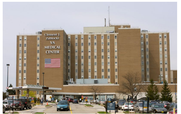
Milwaukee VA Hospital

The Milwaukee VA Hospital Cardiac Catheterization Laboratory is comprised of 2 state-of-the-art highresolution digital fluoroscopy units that are shared between interventional cardiology and electrophysiology. The annual number of cardiac and vascular diagnostic and interventional procedures performed in these laboratories is between 750 and 1000, of which approximately 200-250 are coronary interventions.