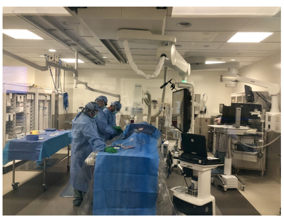
Froedtert Hospital Cath lab

The Milwaukee VA Hospital Cardiac Catheterization Laboratory is comprised of 2 state-of-the-art highresolution digital fluoroscopy units that are shared between interventional cardiology and electrophysiology. The annual number of cardiac and vascular diagnostic and interventional procedures performed in these laboratories is between 750 and 1000, of which approximately 200-250 are coronary interventions.