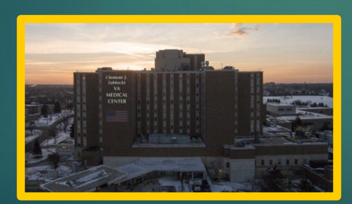
Zablocki VA Regional referral center

Largest free-standing children's hospital in WI